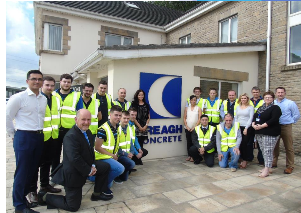
CREAGH ACADEMY STUDENTS AND LECTURERS 2018