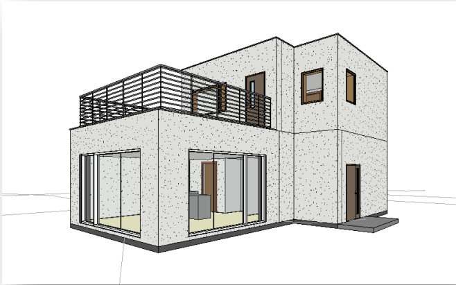
Single Family House