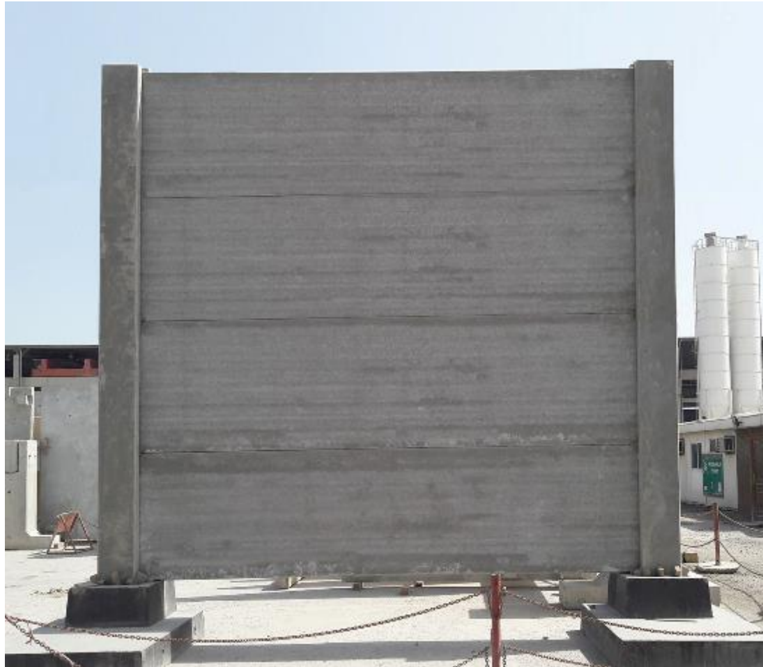
4 slab high wall